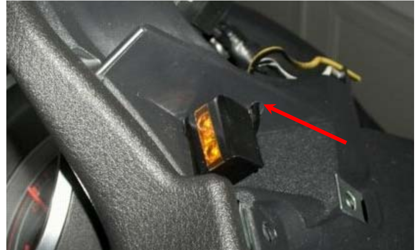
Drill hole to route wires