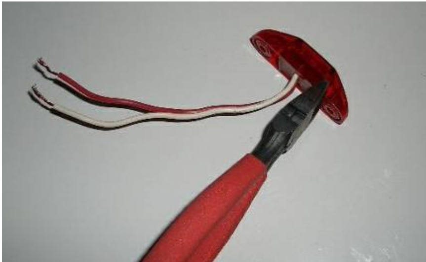
Trim ends with diagonal cutters then sand ends flat