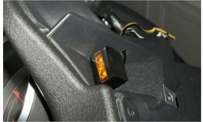
Front masked and the rest of the body painted