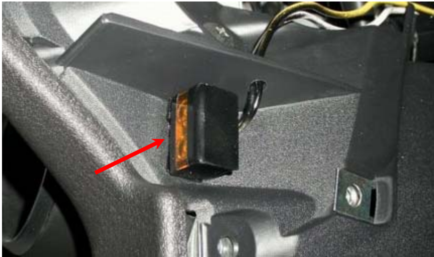
Mount with 3M side molding tape