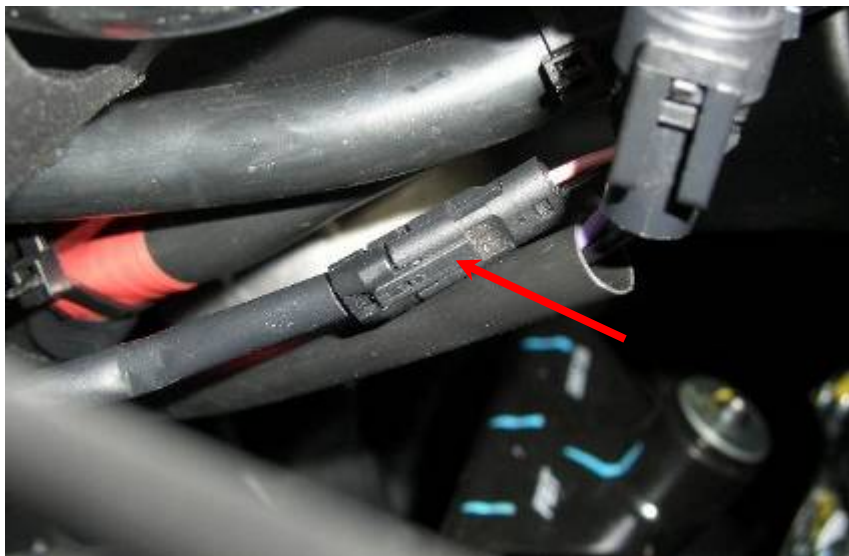
Tap into signal wire circuit between this connector and the front turn signal